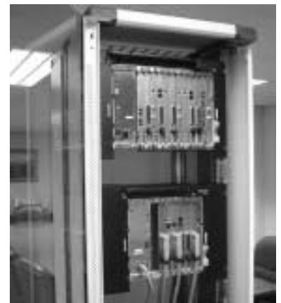
19" Rack Mounting kits available